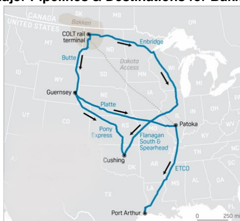
Exhibit 1: Major Pipelines & Destinations for Bakken Crude Oil