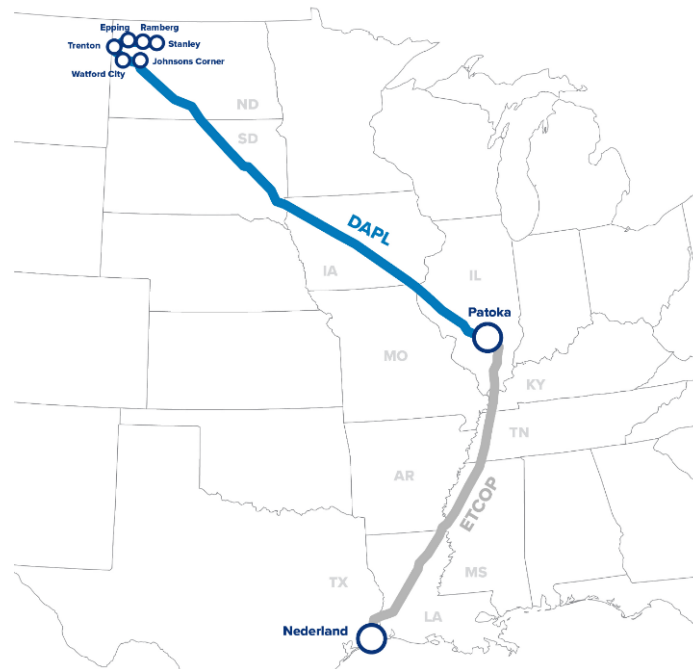
Exhibit 2: Dakota Access Pipeline Map 6

As an interstate pipeline, each April Dakota Access Pipeline, LLC files FERC Form No. 5: Annual Report of Oil Pipeline Companies, which contains the total volume of crude oil it receives in each calendar year. As shown in Table 3 below, crude oil received in North Dakota by Dakota Access Pipeline has averaged 516,869 barrels per day over the three-year period from 2019 to 2021, and ranged from a low of 469,373 per day in 2020 to a high of 565,781 barrels per day in 2019. The variability in crude oil receipts reflects changes in Bakken production levels, the option for participants to respond to market conditions and move crude oil to alternative locations such as Cushing, OK, as well as the DAPL pipeline capacity expansion in 2021.