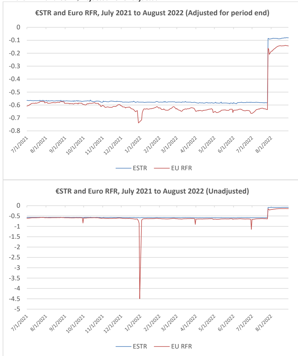
Figure 2.1A – Euro RFR and €STR, Adjusted vs. Unadjusted

As referenced in Figure 2.1B, €STR is strongly correlated with Euro RFR after adjusting Euro RFR data by removing quarter and year-end figures. (Note on the year-end adjustment: during these periods, certain collateral becomes scarce, which affects the rates at which lenders are willing to accept for the underlying bonds). The removal of these period ends are referred to as “Adjusted” in Figure 2.1A.