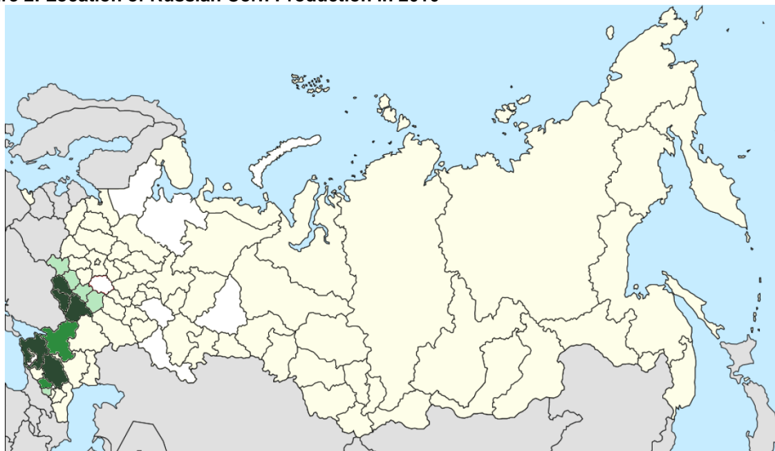
Figure 2: Location of Russian Corn Production in 2016

darker colors indicate higher production.