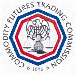
United States Commodity Futures Trading Commission