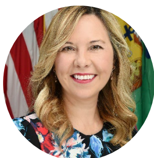
Christy Goldsmith Romero Commissioner

Sworn in as a CFTC Commissioner on March 30, 2022, after being nominated by President Joseph Biden in September 2021, and unanimously confirmed by the United States Senate. Commissioner Johnson is a nationally recognized expert on financial markets risk management law and policy with specialization in the regulation of complex financial products including the origination, distribution, and secondary market trading, clearing, and settlement of securities and derivatives.