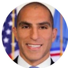
Rostin Behnam Chairman

Sworn in as the CFTC's 15th Chairman on January 4, 2022 after being unanimously confirmed by the U.S. Senate. Chairman Behnam has advocated for the CFTC to use its authority and expertise to ensure the derivatives markets operate transparently and fairly for participants and customers and innovate responsibly. He also spearheaded efforts to invigorate agency-wide diversity and inclusion initiatives. During his legal studies, Chairman Behnam interned with CFTC's Division of Enforcement.